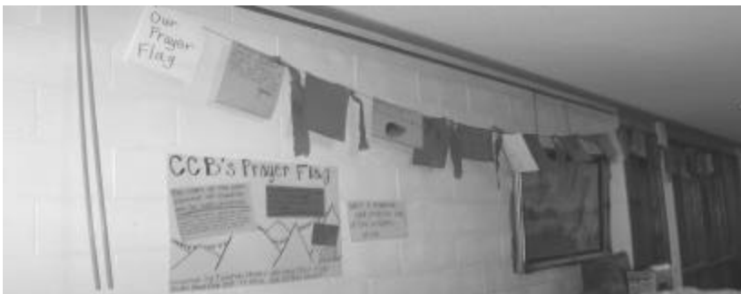
A prayer flag made by our kids, put together by our youth group, the day CCB hired Pastor Zina!