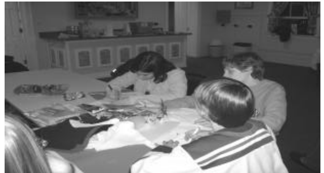
KWRC works on quilt squares to decorate our narthex